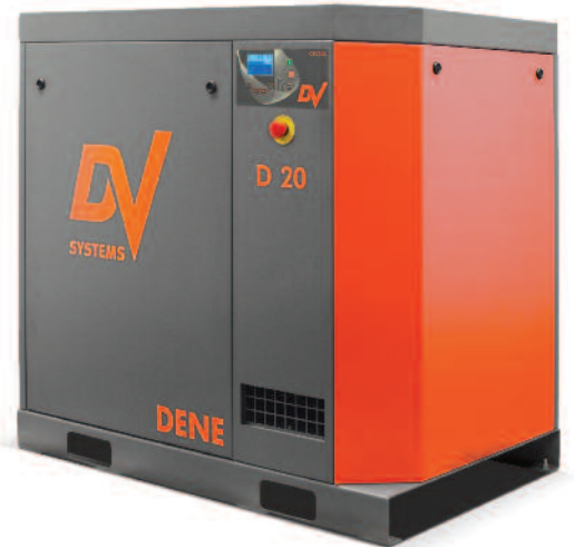
D20 Base Mounted

Innovative component integration results in a compact, quiet air system engineered for efficiency & performance providing high-capacity air delivery and stable system pressure with minimal installation space.